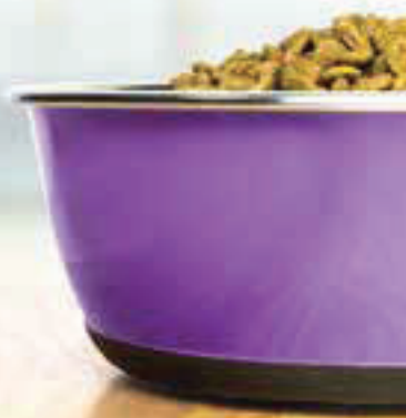
Vegan Garden Medley for Dogs