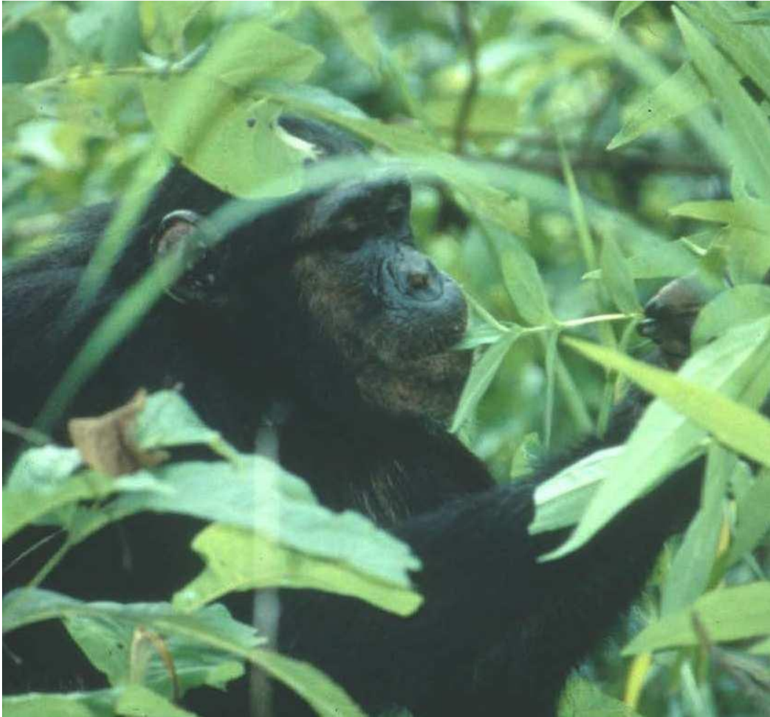
Figure 1: Chimpanzees use plants for their curative properties. Here the individual is folding and swallowing the whole leaves of Aspilia mossambicensis , one of over 40 different species ingested in a way that has been shown to physically purge intestinal worms from Africa great apes (Huffman et al., 1997).

geese, finches, raptors) and insects (e.g., bumble bees, ants, butterflies) (Engel, 2002; Huffman, 2007).