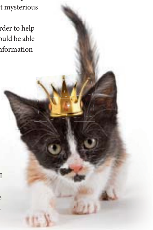
Tortie and white

So next time you look at your cow kitty, keep in mind that he's more than simply white-and-black. Inside he's a black tabby; outside he's a bicolor harlequin resulting from non-agouti dominance with medium grade spotting. But you can call him cow kitty.