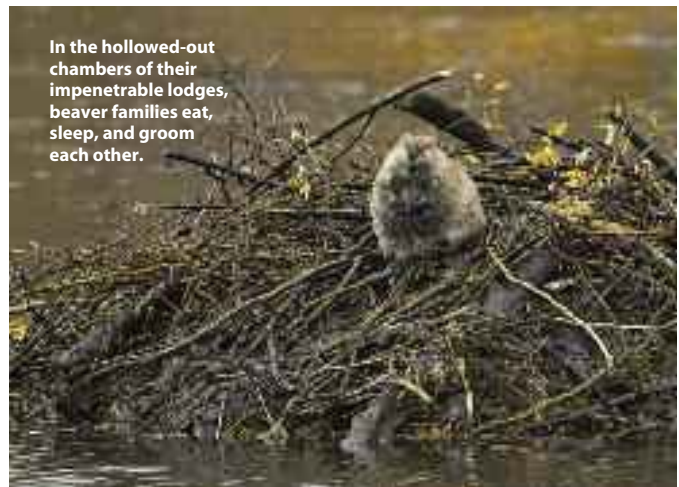
In the hollowed-out chambers of their impenetrable lodges, beaver families eat, sleep, and groom each other.

over the place ... and the beavers had built the dam right back up the next night," she says.