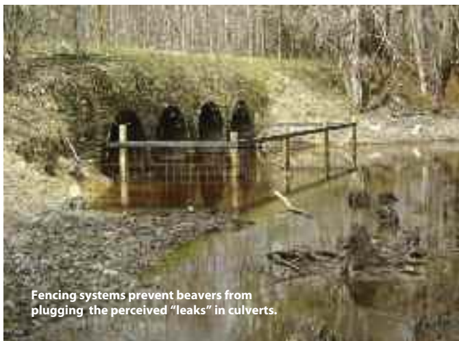
Fencing systems prevent beavers from plugging the perceived "leaks" in culverts.