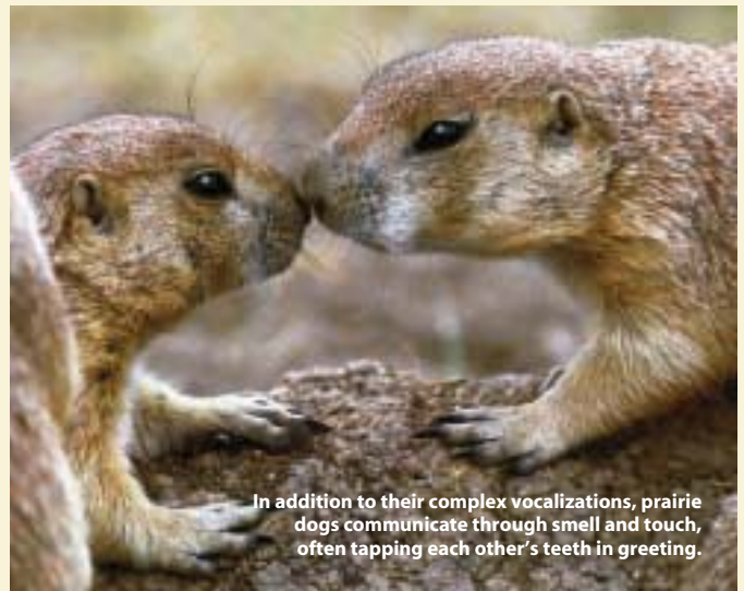
In addition to their complex vocalizations, prairie dogs communicate through smell and touch, often tapping each other's teeth in greeting.