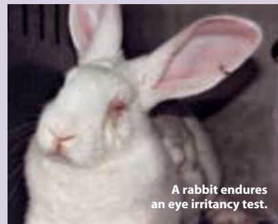
A rabbit endures an eye irritancy test.