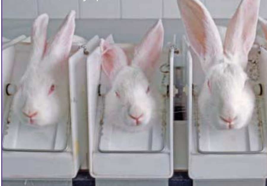
Full-body restraints hold rabbits during the application of a test substance to their eyes—in some cases, for more than 24 hours following the procedure.

With nearly 300 brands used by 3 billion people every day, Procter & Gamble is well-positioned to help drive change in the field. The company has spent more than $250 million over the past 22 years on alternatives, reducing its animal usage by 98 percent in that time, aiding in the development