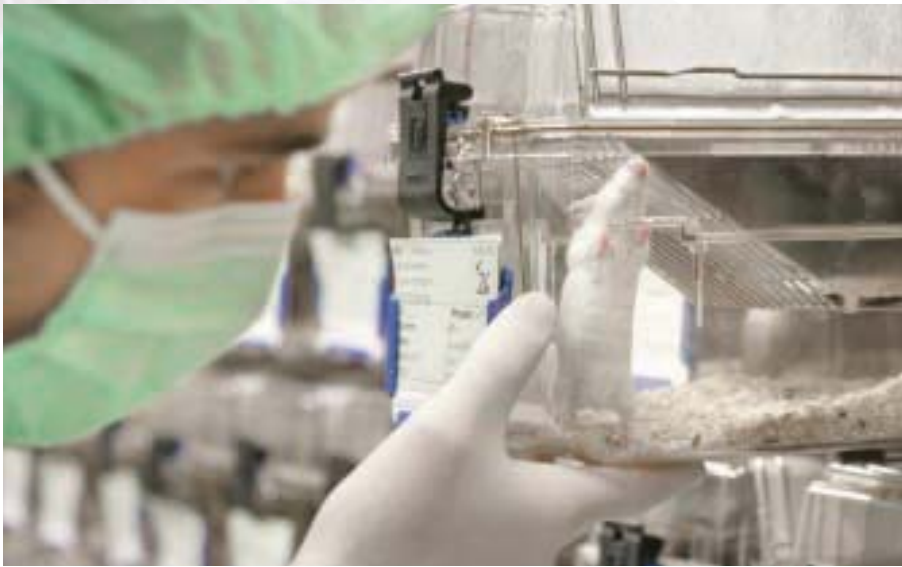
Most rodents in labs live alone in shoebox-size cages with nothing to do; experiments may leave them in near constant pain with no relief.

from a lab and put in an enclosed natural area revealed something different: They immediately began digging burrows, building nests, and creating their own society.