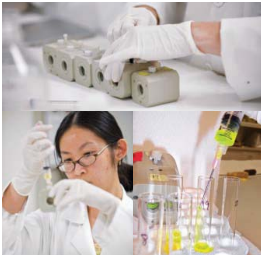
Workers at the Institute for In Vitro Sciences assess products for eye irritation using cow corneas left over from the meat industry and kept in cubelike chambers—a method preferable to using live animals. After a test substance is applied, the corneas are measured for opacity; the cloudier the cornea and the more the outermost tissues swell, the greater the irritation. A second test is performed using dye to measure the effects of irritation on the cornea's permeability. These precise assessments replace the subjective Draize test on rabbits, where researchers visually determine the level of irritation and assign a score.

In Europe, the push for alternatives has long been driven by cultural views on animal protection, as well as laws such as a 1986 requirement that nonanimal tests be used wherever available and a 2003 EU directive phasing in a ban on animal testing of cosmetics products and their raw ingredients. Even a large-scale EU chemical testing program has pushed corporations and governments to invest in nonanimal tests, says Stephens.