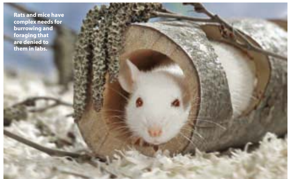
Rats and mice have complex needs for burrowing and foraging that are denied to them in labs.

Interpretation of the results also poses problems, Stephens notes. “Some animals are going to get cancer just because animals