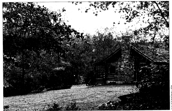
With its name change, NAHEE has launched new, successful projects from the wooded Norma Terris Center in East Haddam, Conn.

The best news is that the price of providing these materials as a gift to a teacher will remain $18. Please don't wait until 1990 to "adopt" a teacher with a gift subscription: write to NAHEE, 67 Salem Road, East Haddam, CT 06423, for more information. ■