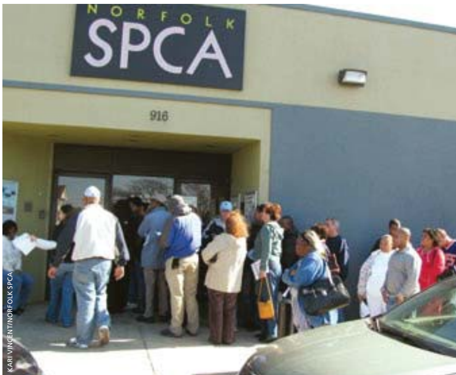
Once news hits that puppy mill dogs are available for adoption, the response is often tremendous. In this instance, the Norfolk SPCA received 200 applications for about 30 puppy mill dogs.

bleasing for shelters that are hard-pressed for space.