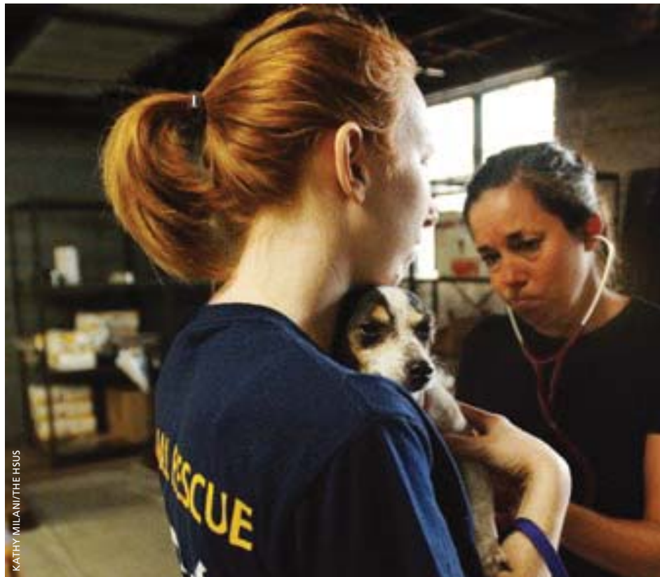
One of the first steps during the intake of puppy mill dogs is a physical examination of each dog, with veterinarians and staff checking for medical conditions that need immediate care. This pup was one of more than 200 dogs rescued in a 2009 HSUS raid on a puppy mill in New Albany, Ind.

Team members often assist on-site at the bust, pick up the animals included in a warrant issued by local authorities, and transport them back to the shelter. A triage team is set up and waiting for them, with veterinarians, technicians, and shelter workers. Each dog is photographed, tagged, and gets a complete initial physical, so any health issues can be identified. The shelter waits to deal with behavior issues, says Campbell; the top priority is to give the dogs relief from suffering caused by longstanding neglect. That often means bathing and grooming them, washing away months or even years of accumulated filth, which goes a long way toward helping the dogs feel much better. Staff treats their medical problems, easing the pain of mange or skin infections, and they provide treatment for flea and tick infestation. The more com-