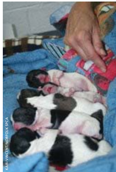
Veterinary staff of the Norfolk SPCA delivered these puppies by cesarian from a shih tzu named Jocelyn who was taken in from a puppy mill raid. All of the puppies went right into foster care with their mother, and they were officially adopted once they reached 8 weeks of age.