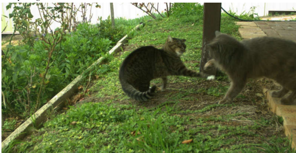
Figure 3. Evidence of cats conflicting with pet cats: a stray cat (any cat without a collar, etc., [192] in Western Australia) interacting with a pet cat in its owners' backyard (pet cat on left).

Stray cats encroaching into private backyards can intimidate, steal food or fight pet cats in their home range [1] (Figure 3). Colonies attract other cats, including pets (e.g., [43]). In both situations, and regardless of neuter status, fighting and disease transmission can result. The mouths and claws of cats contain myriad pathogens that can compromise the health of fight-victims [203,204]. In Sydney, Australia, the prevalence of FIV in 48 colony cats and 20 TNR cats was 21% and 25% respectively [17]; higher than the 16% prevalence in 169 pet cats with access to the outdoors. In Perth, Western Australia, a study of 418 fecal samples from cats, pets had four times lower prevalence of gastrointestinal parasites compared with refuge cats and kittens (2% vs. 8% [205]). The degree of contact that cats had with other cats (and dogs) significantly influenced the prevalence of parasitic infection [205]. Therefore, even if pet cats are regularly vaccinated and dewormed, TNR may increase urban cat densities overall and increase the likelihood of cats fighting and being exposed to common or novel pathogens.