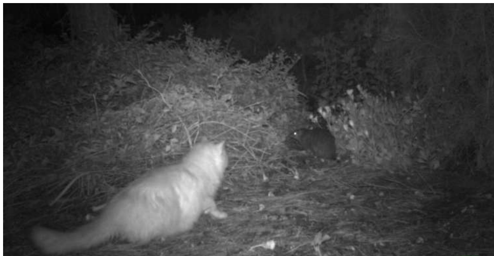
Figure 4. Evidence of cats conflicting with wildlife: a stray cat (in Western Australia, any cat without a collar, etc. [192]) stalking a quenda, an endemic species of bandicoot ( Isoodon fusciventer ) in an urban bushland reserve.

Australian cities contain more threatened animal species per unit area than non-urban areas [221]. For example, Bryant et al. [222] documented the persistence of native quenda ( Isoodon fusciventer , an endemic species of bandicoot) living in Mandurah, Western Australia; however, roaming cats stalk and kill quenda ([191,219] Figure 4). Another study showed that a single, well-fed pet cat drove the local extirpation of a Ctenotus sp. lizard population [223]. Minimizing further anthropogenic impacts on wildlife populations persisting in urban areas includes introducing measures that reduce predation by stray and pet cats. Various predation deterrent strategies have been trialed (e.g., bells [224,225], pounce protectors [217,225], auditory deterrents [191,226,227], curfews [228,229], buffers [230]) with mixed success. In Australia, the impact that even small TNR colonies could have on endemic or range-restricted fauna therefore cannot be discounted. Trials of TNR to determine predation impact on these species should not be risked.