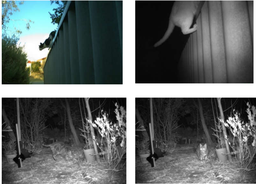
Figure 2. Evidence that free-roaming cats engage in nuisance activity on private properties. Top left and right: Two stray cats enter and exit the front yard of a private property by climbing over a boundary-fence. Bottom left and right: A stray cat defecates on a garden path in a suburban backyard. (in Western Australia, stray cats are any cat without a collar, etc. [192]).