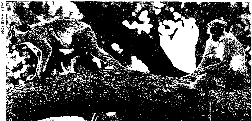
Figure 3 Two adult female green monkeys ( Cercopithecus sabaues ) with their infants.