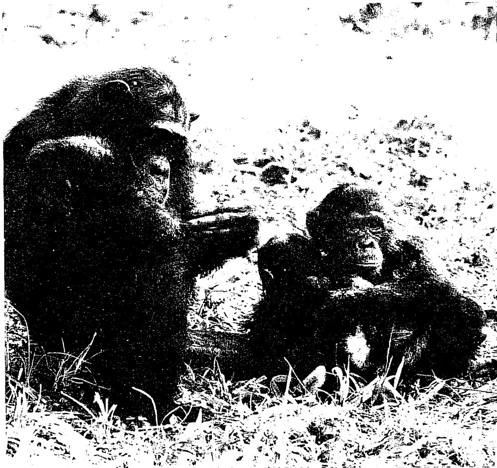
Figure 6 A juvenile female chimpanzee embraces her younger brother while their mother grooms herself.