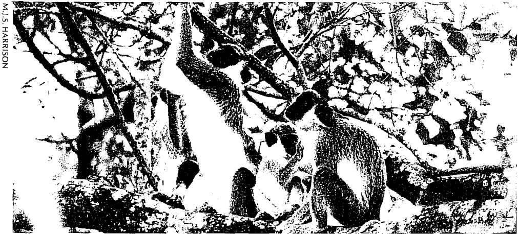
Figure 5 Two adult green monkeys are groomed by their offspring.

These observations have numerous implications for primates in captivity. For a male living in a pair with a female, or in a harem-group with two or more females, the spur of male competition is missing. This is especially important for species whose mating strategies evolved in multi-female, multi-male troops, e.g., all macaques, most baboons, and chimpanzees. The result may be progressively lower motivation to breed. Such forms should be housed in facilities of adequate size to hold two or more males. Similarly, females living in such captive conditions are prevented from exercising their choice of the fittest males, and their mental and emotional health may decline, along with their motivation to breed. Lack of choice may lead to forced matings. Chimpanzees paired in captivity mate throughout the menstrual cycle, whereas wild chimpanzees confine their matings to periods of female estrus (Tutin, 1980). Such matings result from male intimidation, and primiparous chimpanzees in captivity conceive earlier than their wild counterparts and show high rates of infant mortality (Tutin, 1980). Institutions seeking successful breeding of primates are advised to mimic as closely as possible the natural conditions under which the two sexes play out their mating strategies.