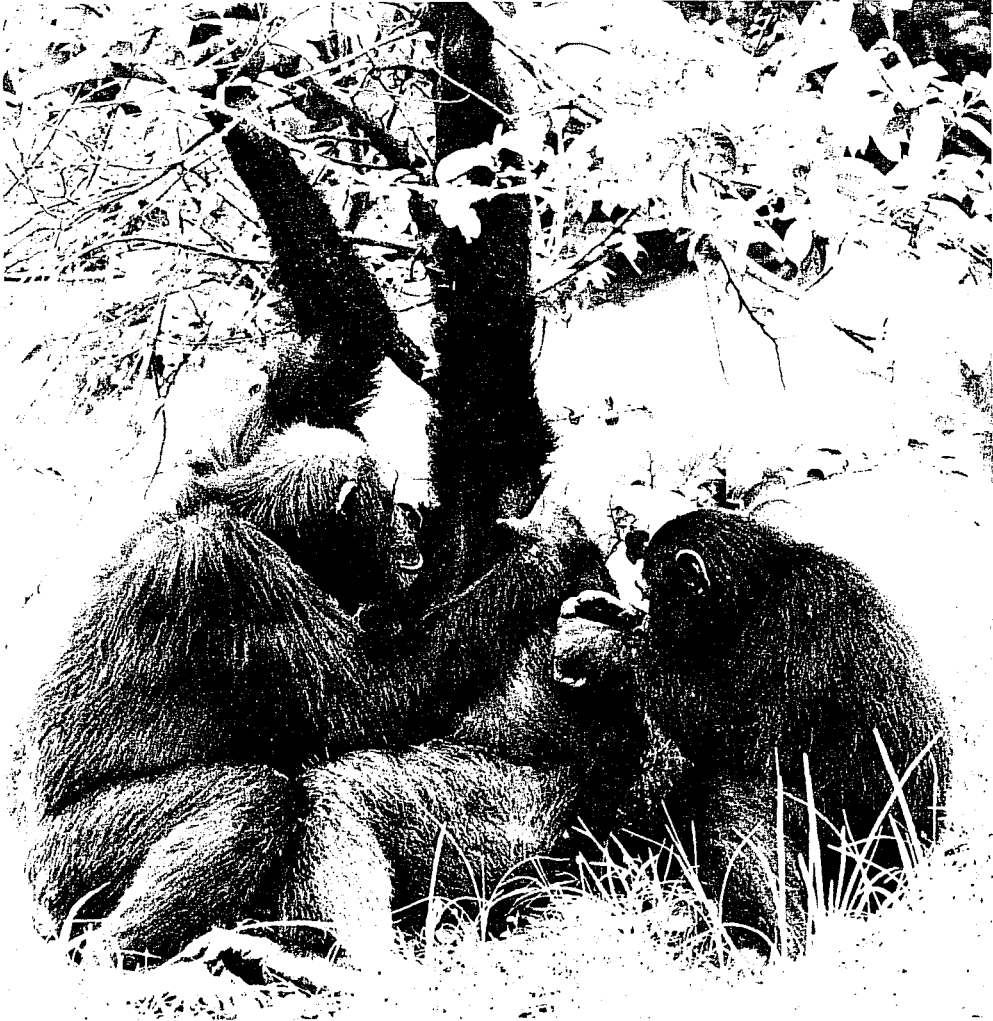
Figure 1 Three male chimpanzees engage in quiet, social grooming.

sical health. Finally, the plasticity of primate behavior is not without limits, and research procedures that push subjects beyond those limits run the risk of distorting or even nullifying the results obtained. In short, lab and zoo workers should listen to field workers, for they sometimes can supply crucial knowledge. (Of course, the reverse may also be true, but that is the subject for another paper).