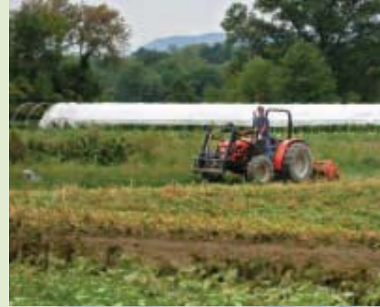
RON KHOSLA tills at shallow depths to protect tiny creatures that bring nutrients to the soil (top); the Khoslas grow rye and hairy vetch cover crops to nourish their pumpkin patch.

Hand-in-hand with this localized approach, Kelly advises gardeners to take a long-term perspective. "If you start with a lawn and you want to start gardening right away, then [you're] going to be more inclined to buy these bagged materials and to import these sorts of things," she says, "whereas if you start to prepare the soil at least a season ahead of time, then the soil that you have might be more ready without necessarily buying dirt."