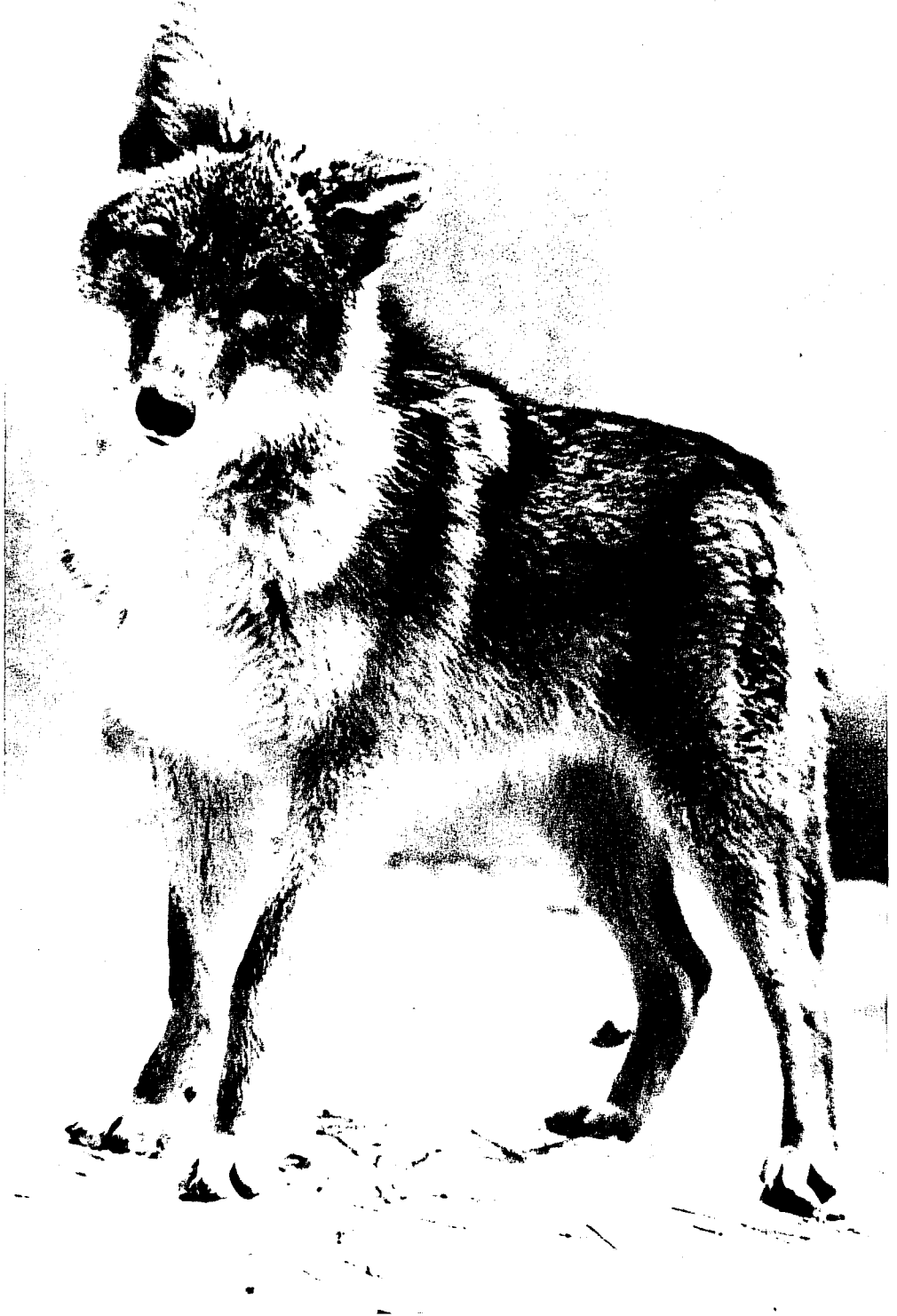
Figure 1 The coyote, Canis latrans .