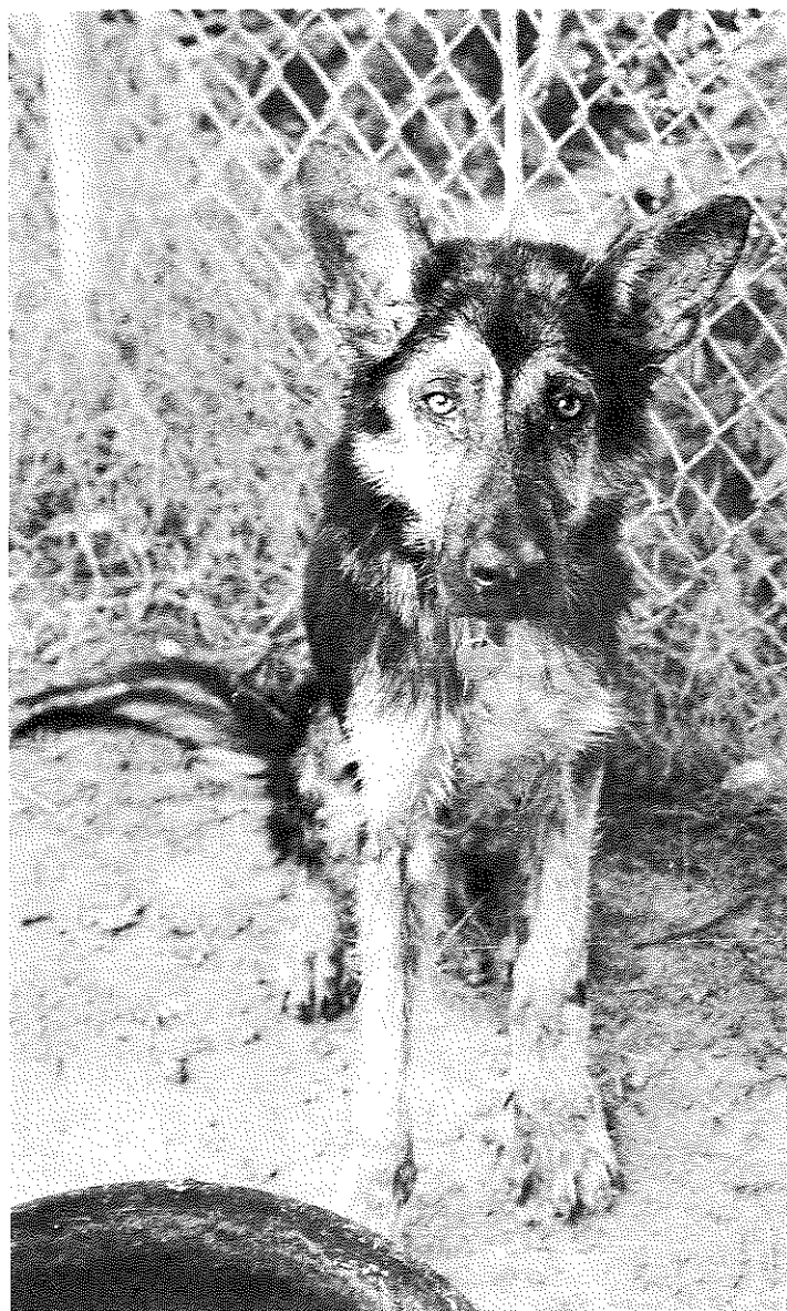
This dog is suffering with mange and a swollen leg. Instead of placing it in a cage directly from the animal control truck, a determination of its medical condition should have been made followed by rapid treatment or euthanasia to end its misery. Lack of veterinary care at a pound that handles many animals is an open invitation to suffering.

The Humane Society of the United States is constantly working to end cruelties such as these. The following report will tell you of some of the conditions HSUS investigators have found in dog pounds across the country, how HSUS is working to improve them, and how you can help.