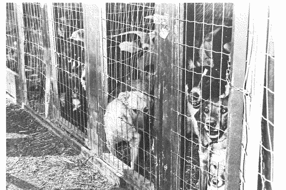
Crowding is cruel. Dogs should be separated by size, sex, and temperament. Pound workers must pay special attention to this seemingly obvious detail, otherwise fights are inevitable.