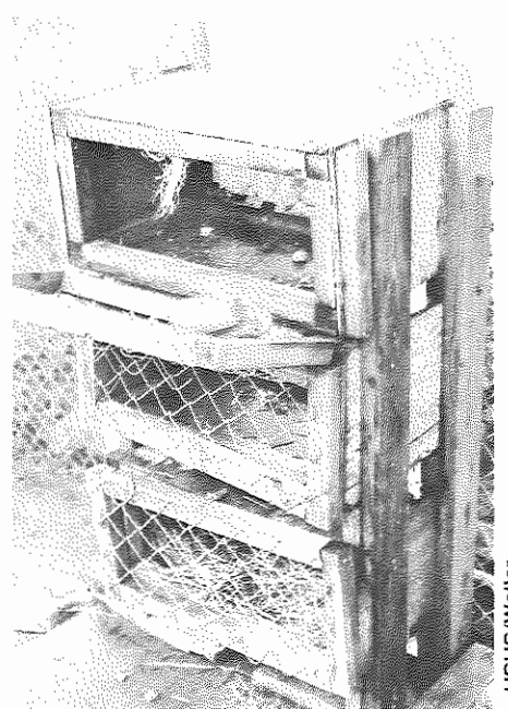
Even though the unwanted cat problem is just as immense as the dog problem, some pounds don't even take them in. Of those that do, too many treat cats as second class citizens. This is one pound's idea of cat cages.

enough to say, "These animals are suffering." There must be witnesses to say, for example, "On March 15 at 11:00 A.M., I was at the pound and saw 27 dogs in a pen measuring 10' by 10'." Each item of cruelty must be witnessed. Many animal lovers are squeamish about going to the pound. They hate to see animals in pain or discomfort, especially when they have no authority to relieve the suffering on the spot. But this heartbreaking chore is a necessity if conditions are ever to change.