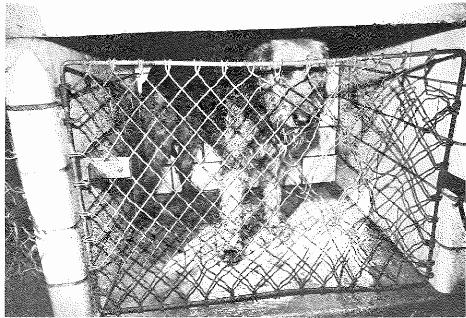
Taken in a midwestern city, this photo depicts a common pound problem — cramped quarters. Obviously, this cage was designed for an animal much smaller than this Airedale. Note the broken wires and gaping hole. Just imagine what might happen to a dog that pokes its nose through the opening.

Although the pound's purpose is to protect the people in the community, that is no excuse for cruel and